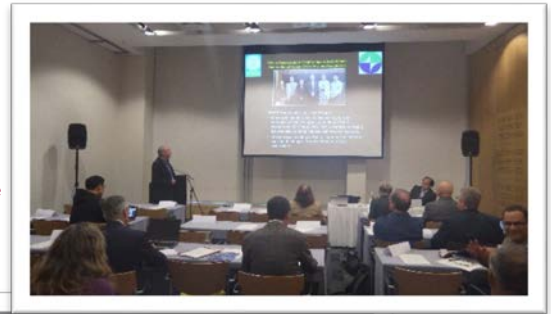
1 st Executive Committee Meeting

During this Assembly, IAMAS held some business meetings and the Reception Dinner. The minutes are uploaded at http://www.iamas.org/reports-downloads/ .