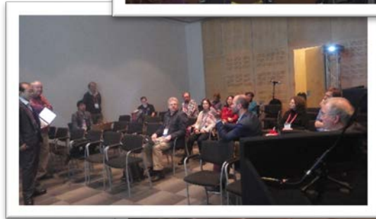
Brain Storming Meeting for IUGG2019