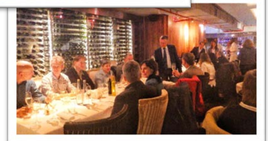
IAMAS Reception Dinner at Sevruga