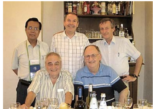
The IAMAS Bureau members and incoming Officers at the 2007 IUGG General Assembly in Perugia, Italy