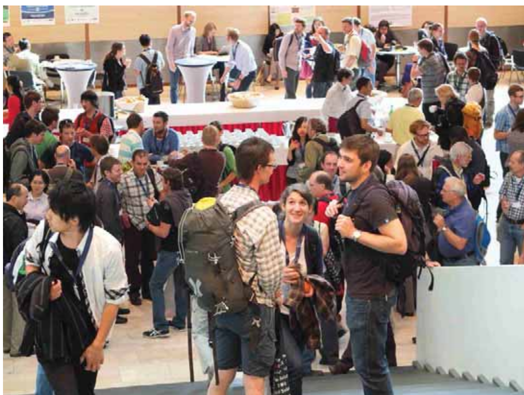
Intense discussions during a coffee break.