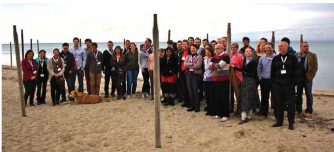
Participants of the School.

The five-day program featured lectures, a computer class, a poster session, two movies with a debate, and a daily assessment. Lectures addressed various aspects of the Sun-climate connection, with a blend of fundamental physical issues, key questions, and practical aspects such as existing sources of data. Among the lessons learnt were the importance of being pedagogically innovative in order to get