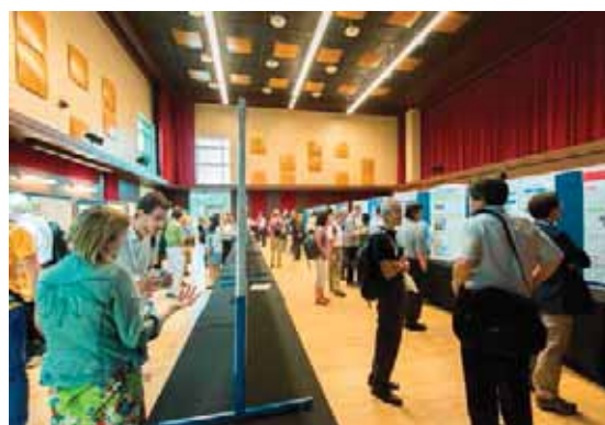
At the ICNAA conference in Fort Collins, USA