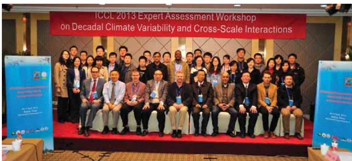
The workshop participants